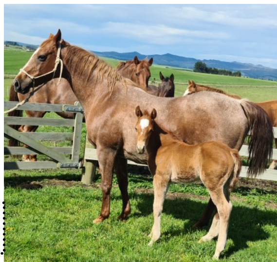
(filly) Kings Playboy x Little Peptos Chance