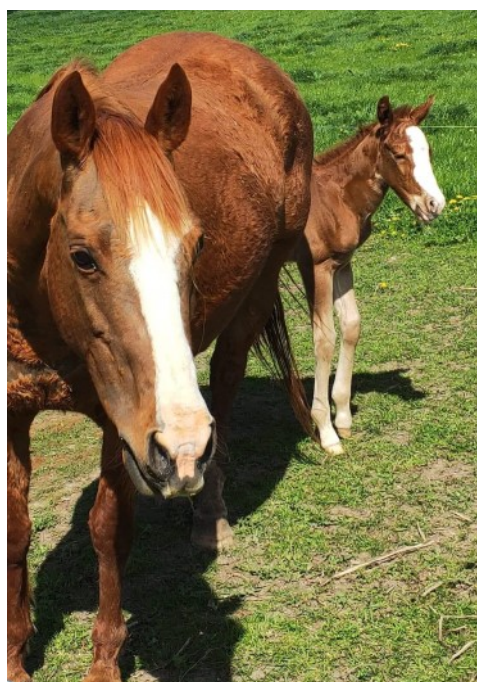
(colt) Kings Playboy x Winderadeen Scotstyle