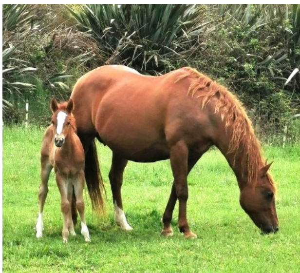
Cinch (colt) Chrome N Oak x Little Peppys Hank