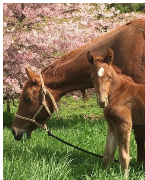
(colt) By Reckless Driver