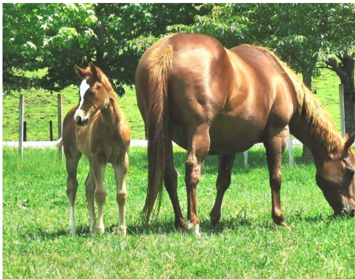
PEARL (filly) Chrome N Oak x Sonitas Durack