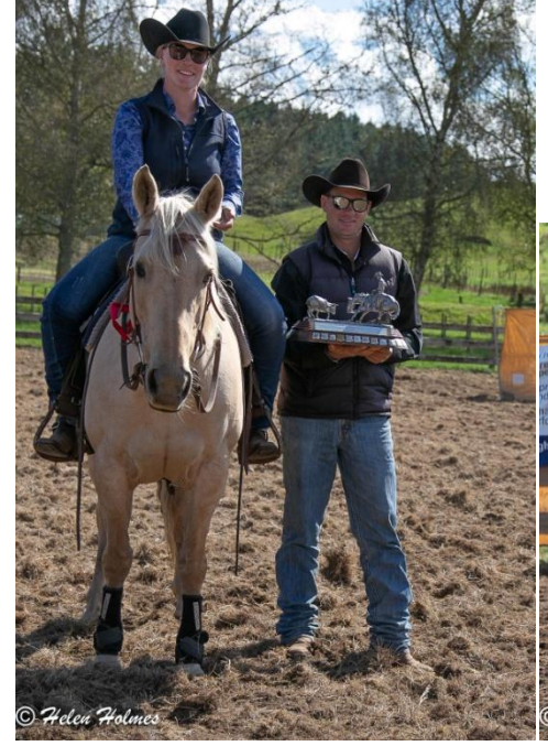
National Snaffle Bit Rider Champion National Reserve Snaffle Bit Rider