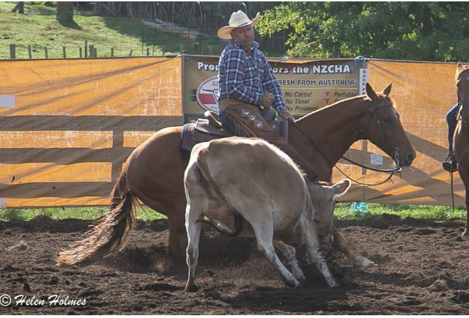
National Open Horse Champion National Reserve Open Horse 3<sup>rd=</sup> 3<sup>rd</sup>