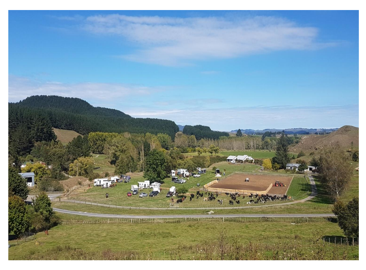
National Finals Venue 2019 - Waimiha, King Country