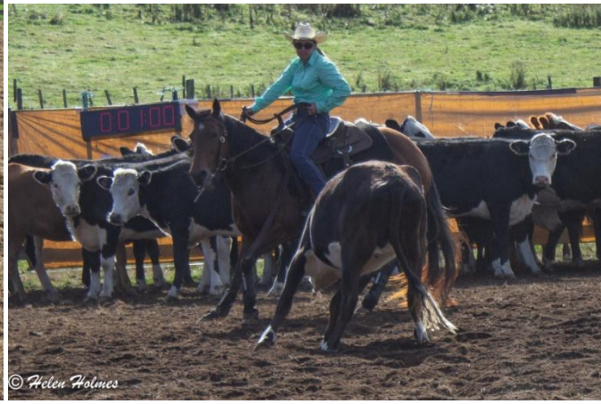
National Snaffle Bit Horse Champion National Reserve Snaffle Bit Horses = National Reserve Snaffle Bit Horses =